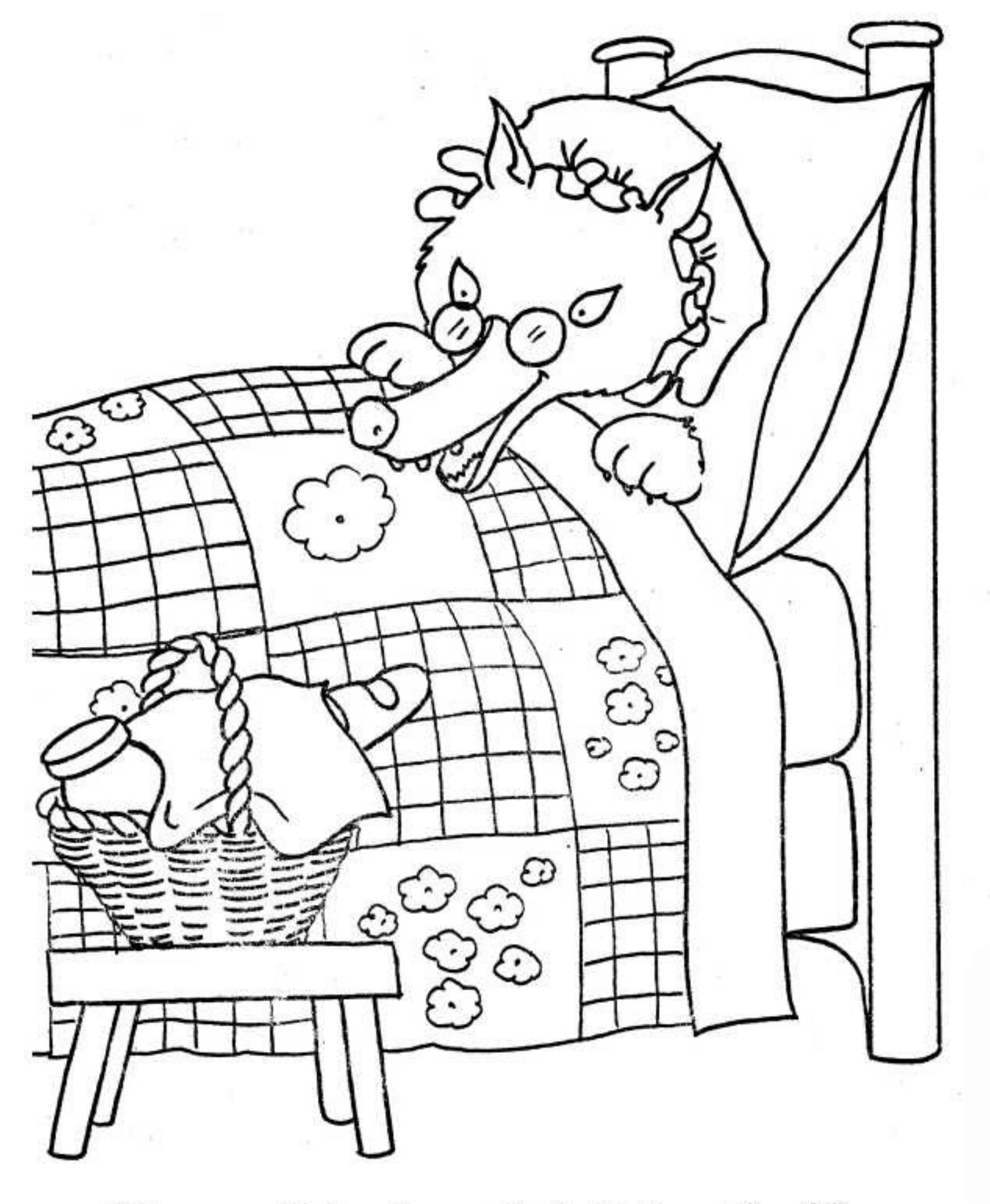
"Come a little closer, Red Riding Hood!"